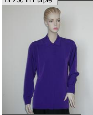
Longer length shirt with yoke and full length sleeves