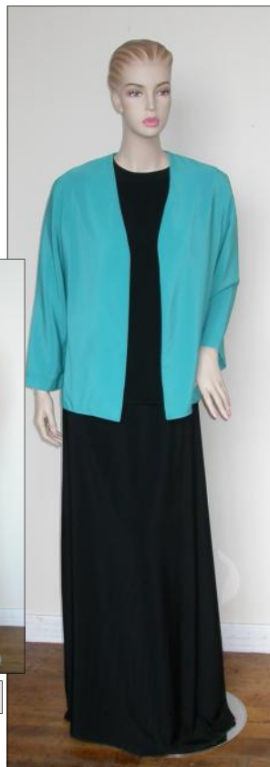
X132 + BL1110 + X101