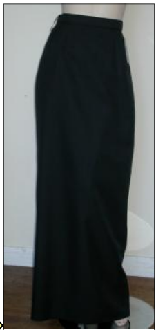
X102 Straight skirt with back split