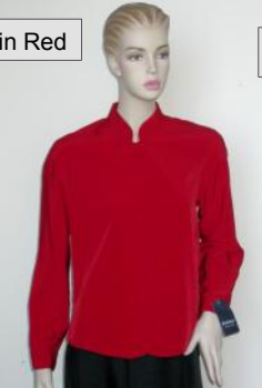
Mandarin neck, rounded fronts, full length sleeves