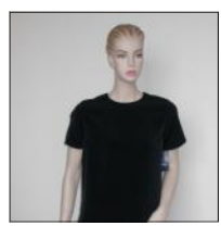
Tops BL228 (L) and BL1110 (R)

Style details can be mix and matched—ie the collar from one and the sleeves from another. The choice is yours!