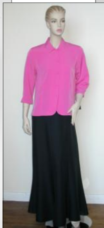
X135 + X103