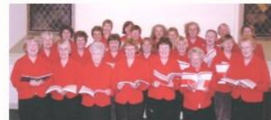
Berwick Arts Choir