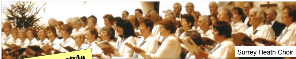
Surrey Heath Choir