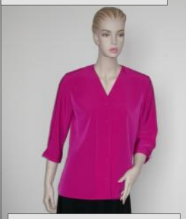
'V' neck, longer length and 3/4 sleeves