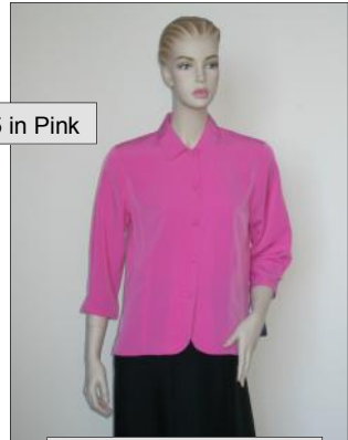
Style as BL229 above but with 3/4 sleeves