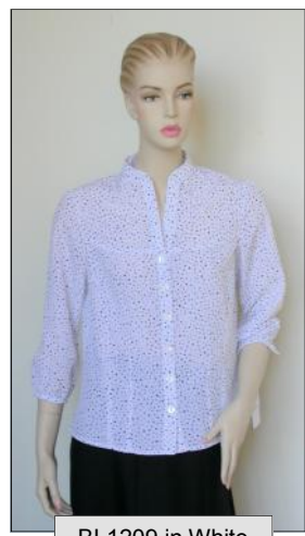
BL1209 in White with black spot