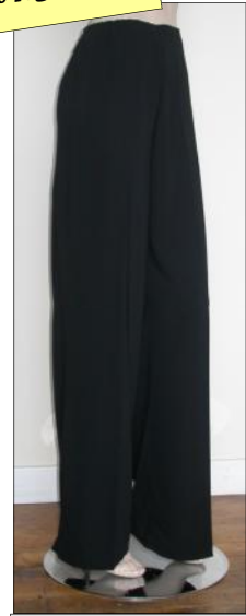
X137 Wide leg trousers with elastic waist and side zip