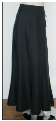
X103 Stylish 'fit'n'flare'