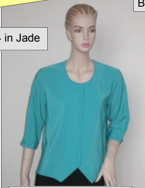
Round neck, notched front, 3/4 sleeves