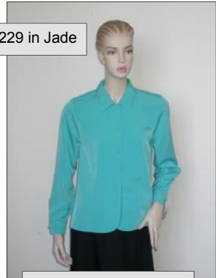
Neat collar, rounded fronts, full length sleeves