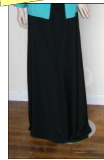
X101 Elastic waist 'A' line skirt