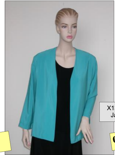
X132 Edge to edge Jacket in Jade over BL228 Camitop