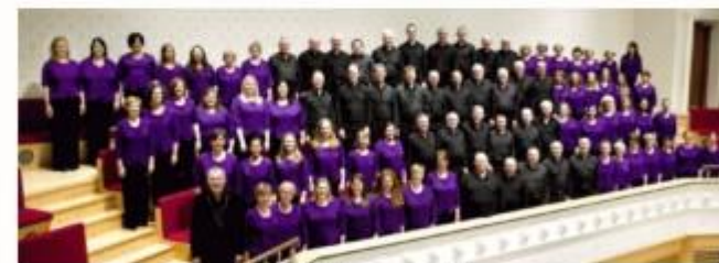
City of Glasgow Chorus